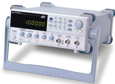
SFG-2100 Series (20/10/7/4 MHz)