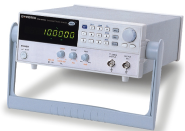
SFG-2000 Series (20/10/7/4 MHz)