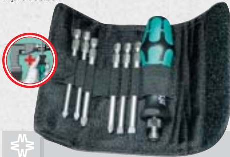
Kraftform Kompakt® 40 pouch with 89 mm long bits 7 pieces set