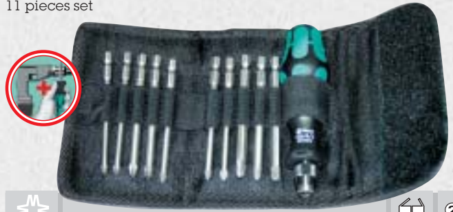
Kraftform Kompakt® 41 pouch with 89 mm long bits 11 pieces set