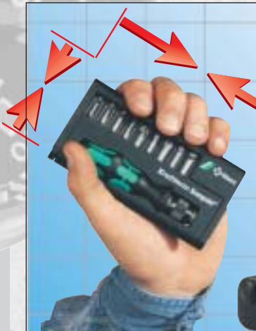
Compact boxes – small enough for the pocket.