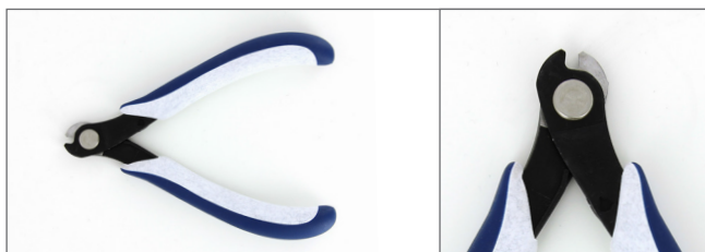
DT000065 - Hard Wire Cutter. OAL: 140 mm