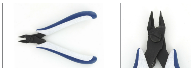
DT000071 - Tapered Head Micro-Shear Flush Cutter. OAL: 135 mm