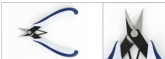
DT000070 - Kevlar Scissors. OAL: 150 mm