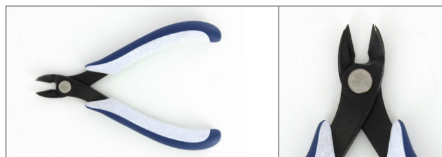
DT000064 - Maxi-Shear Flush Cutter. OAL: 150 mm