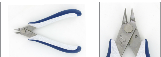
DT000072 - Micro-Shear Flush Cutter - Polished. OAL: 127 mm