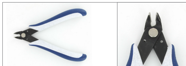
DT000067 - Angled Micro-Shear Flush Cutter. OAL: 125 mm