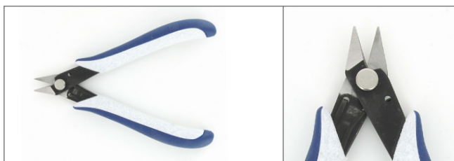
DT000068 - Mini-Scissor. OAL: 130 mm