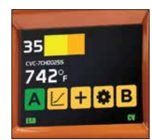
Tip temperature displayed on large color screen.