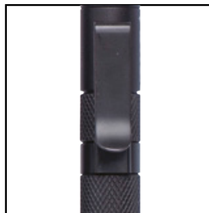
> Pocket Clip