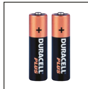
> 2 x AAA Batteries (Included)