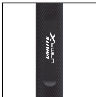
> Contoured Hatch Grip Body