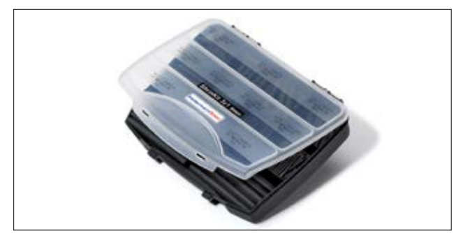
ShrinKit 321 Basic.