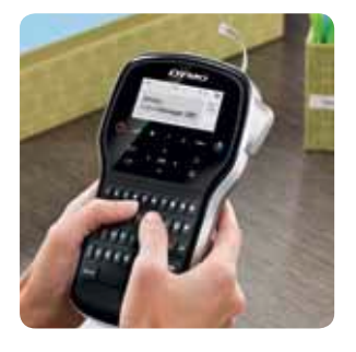
At your desk