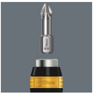
Rapidaptor technology makes the tool adaptable since bits and sockets can be exchanged rapidly.