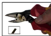
Plain shearing of brass screws M 3.5 + M4