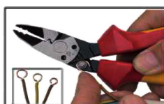
Looping device Ø 4, 5, 6mm