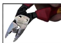
Diagonal cutter 14mm length