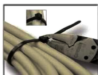
Accurate flat cutter