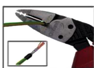
Crimping of ferrules 1.5 + 2.5mm 2