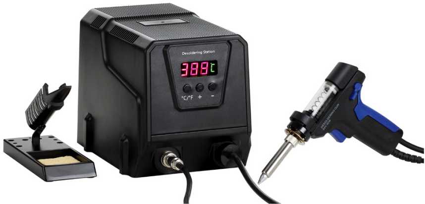
90W Digital Desoldering Station Model: MP740415