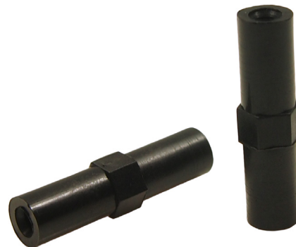
MP002204 - 1\frac{1}{4}" (31.7mm)