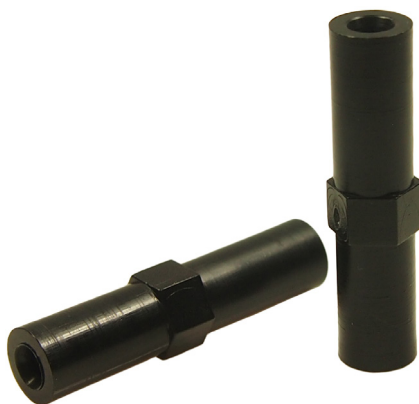
MP002205 - 1\frac{3}{8}" (34.9mm)