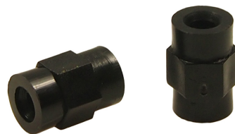
MP002202 - \frac{1}{2}" (12.7mm)