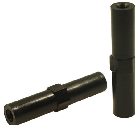
MP002206 - 1\frac{1}{2}" (38.1mm)