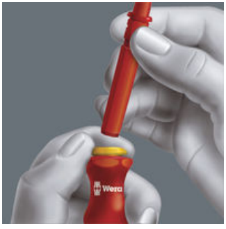
Kraftform Kompakt VDE sets come with an insulated handle and insulated inter-changeable blades, that can be exchanged without any special tools.