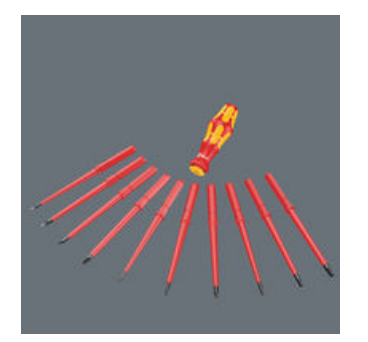
The handle/interchangeable blade system allows rapid exchange of the blades required for a wide range of applications.