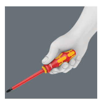
The outstanding design of the Kraftform handle that fits perfectly into the hand prevents hand injuries such as blisters and calluses.

Wera produces the Kraftform handle out of several materials with different properties. Α resistant plastic is used for the core which ensures that the blade is held securely even under high strain. A softer material is used for the coloured soft zones, which provides high frictional resistance and allows the transfer of high forces - resulting in less required screwdriving effort. The red sections with their hard surfaces prevent any "sticking" of the hand to the handle, making rapid repositioning of the hand possible.