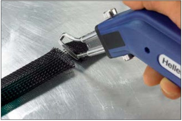
The HSGO hot cutting tool prevents the braided sleeving from fraying.

A replacement blade is available with the item number 170-99002.