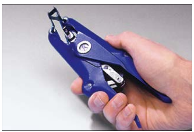
Fast, secure application with the three-pronged expansion tools.